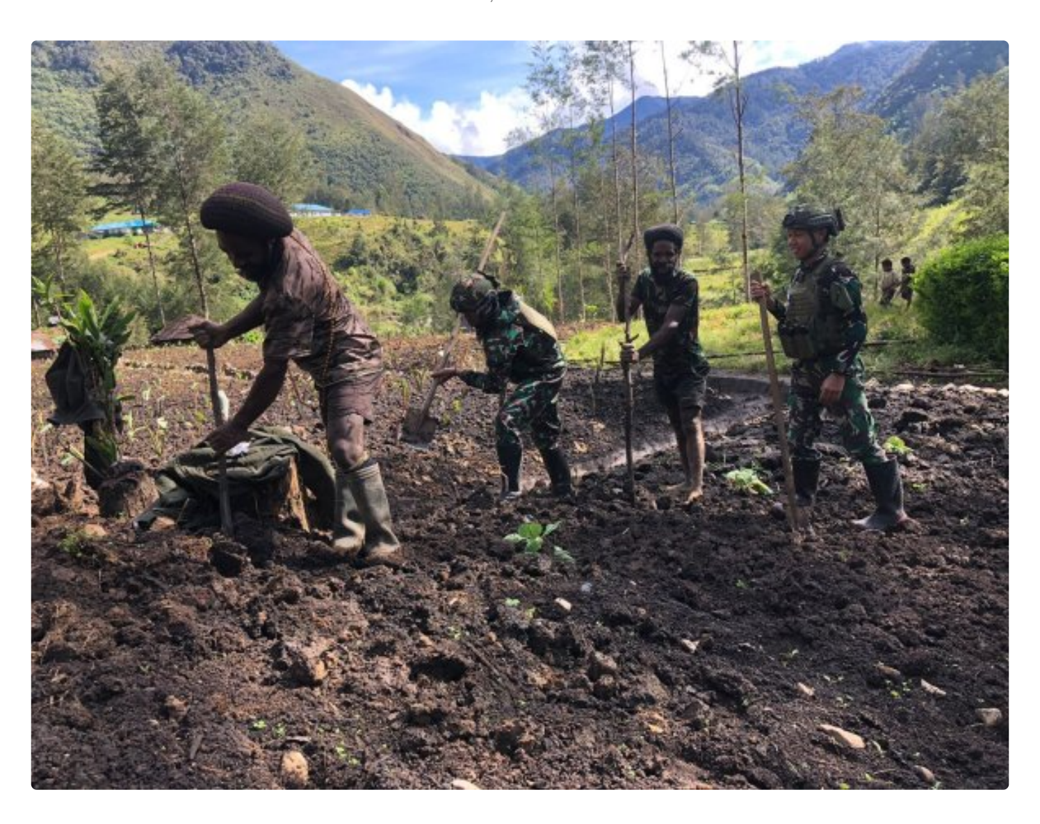
PUNCAK- One of the military units under the command of the Indonesian Armed Forces Operational Command (KOOPS TNI) HABEMA, namely the Task Forces